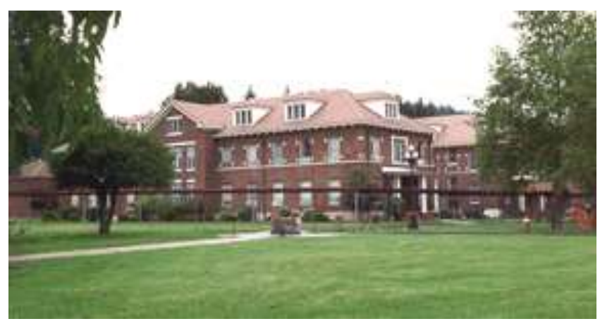
Washington Soldiers Home

<u>The Washington Soldiers Home and Colony.</u> Located on 181 acres in the beautiful Puyallup Valley near Orting. Established in 1891, this was the first home built for Washington state veterans.