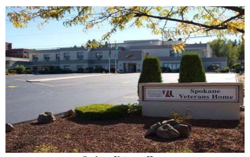
Spokane Veterans Home

<u>Spokane Veterans Home</u>. A place where veterans are treated with the dignity and respect they deserve, in distinctive settings that provide a sense of belonging.